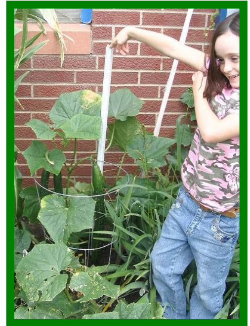
New Rockford student measuring