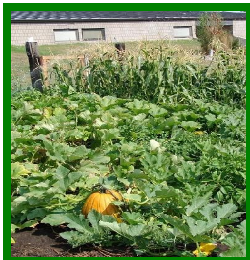
Grandville Middle School garden