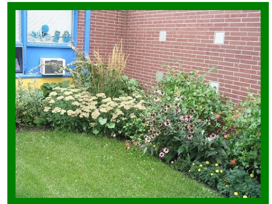
New Rockford - Sheyenne. Flower garden